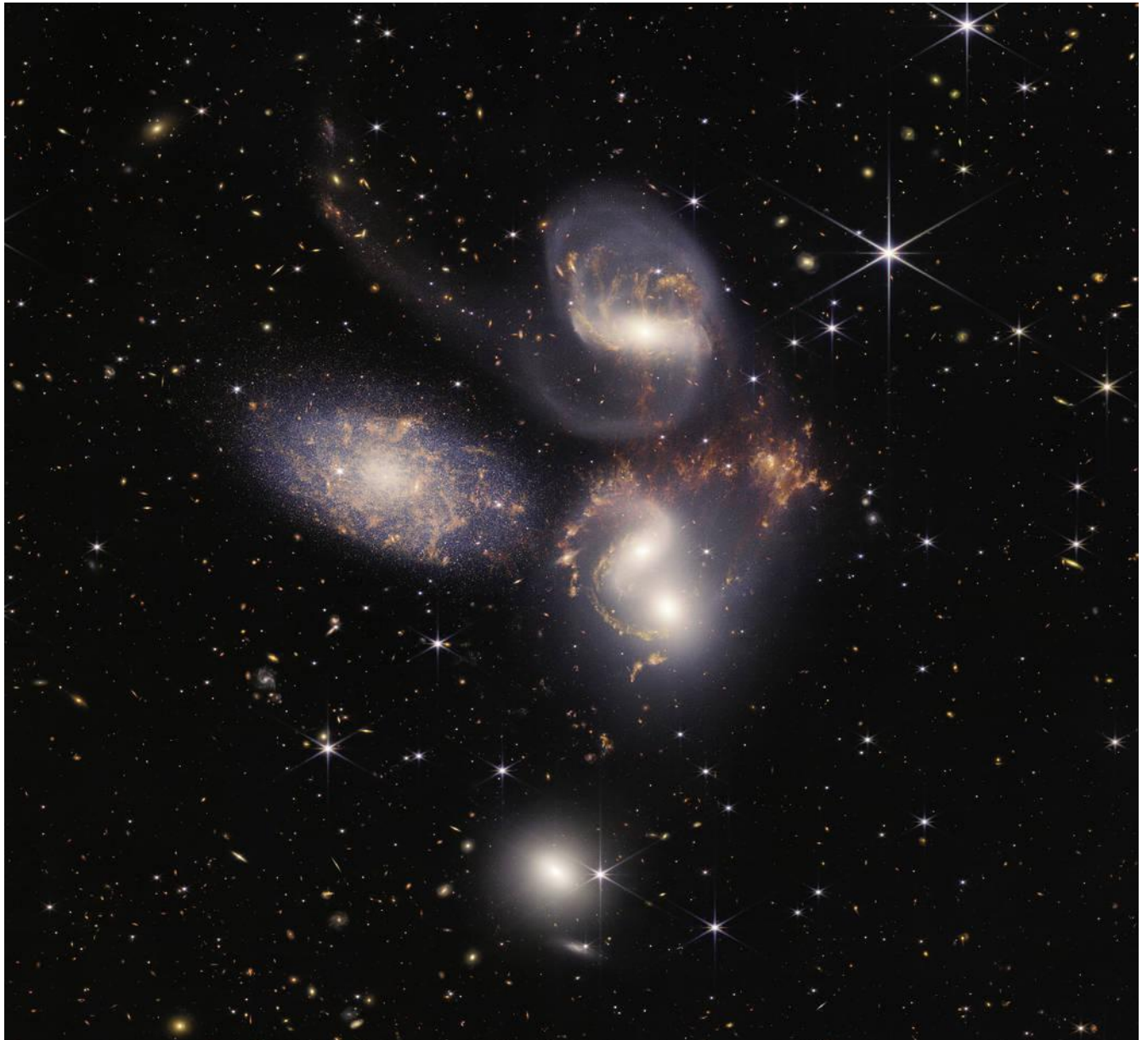
GALAXY GROUP 'STEPHAN'S QUINTET' (Discovered by the French astronomer Édouard Stephan in 1877) also known as the HICKSON COMPACT GROUP 92 (HCG 92).