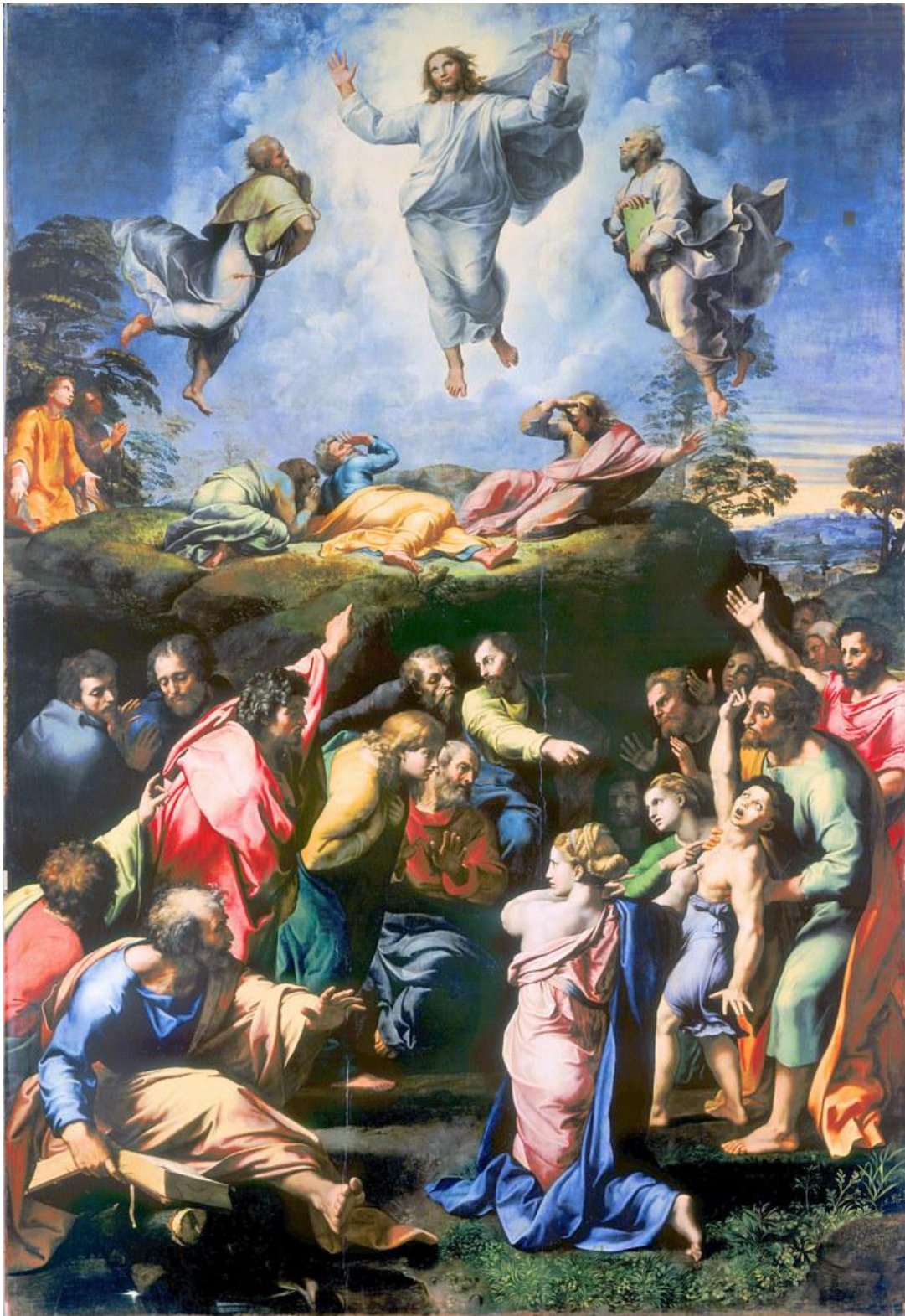
Raphael, The Transfiguration (1520)